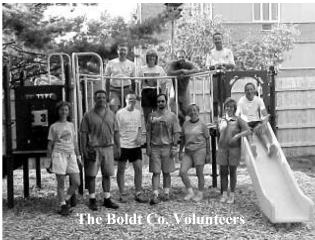
The Boldt Co. Volunteers

The playground was truly a community project: Employees of The Boldt Company and their family members donated their time after their workday on some of the hottest days in July to install the structure and equipment. "This was an opportunity